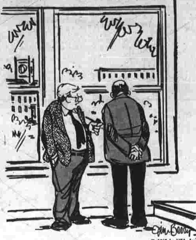
"The only logical explanation is—there are no more party roads, because there are no more... GOOD HEAVENS!"

Garment—Firm—Dairy Products 50 Native Vegetables Fresh tender Sweet Corn, Vine Ripe Tomatoes, Bright Beans, Lima Beans, Cucumbers, Bell Peppers, Conard Grapes, Apples, Peaches, etc. All fresh, first quality, delivered to your door. Call 643-2711.