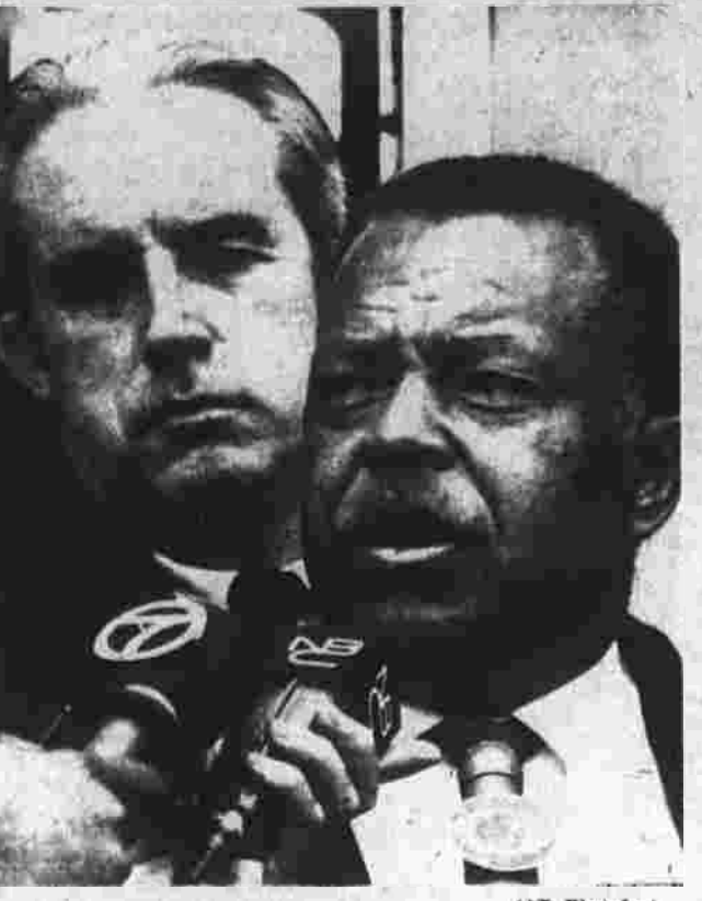
Ocean Hill-Brownsville school district office in Brooklyn. Later, he was ousted as district administrator in a move by the New York Board of Education to avoid another teachers' strike.

The report of the attempted uprising followed by hours a government announcement that South Vietnam's armed forces were on full alert. The official spokesman claimed no knowledge of a coup attempt.