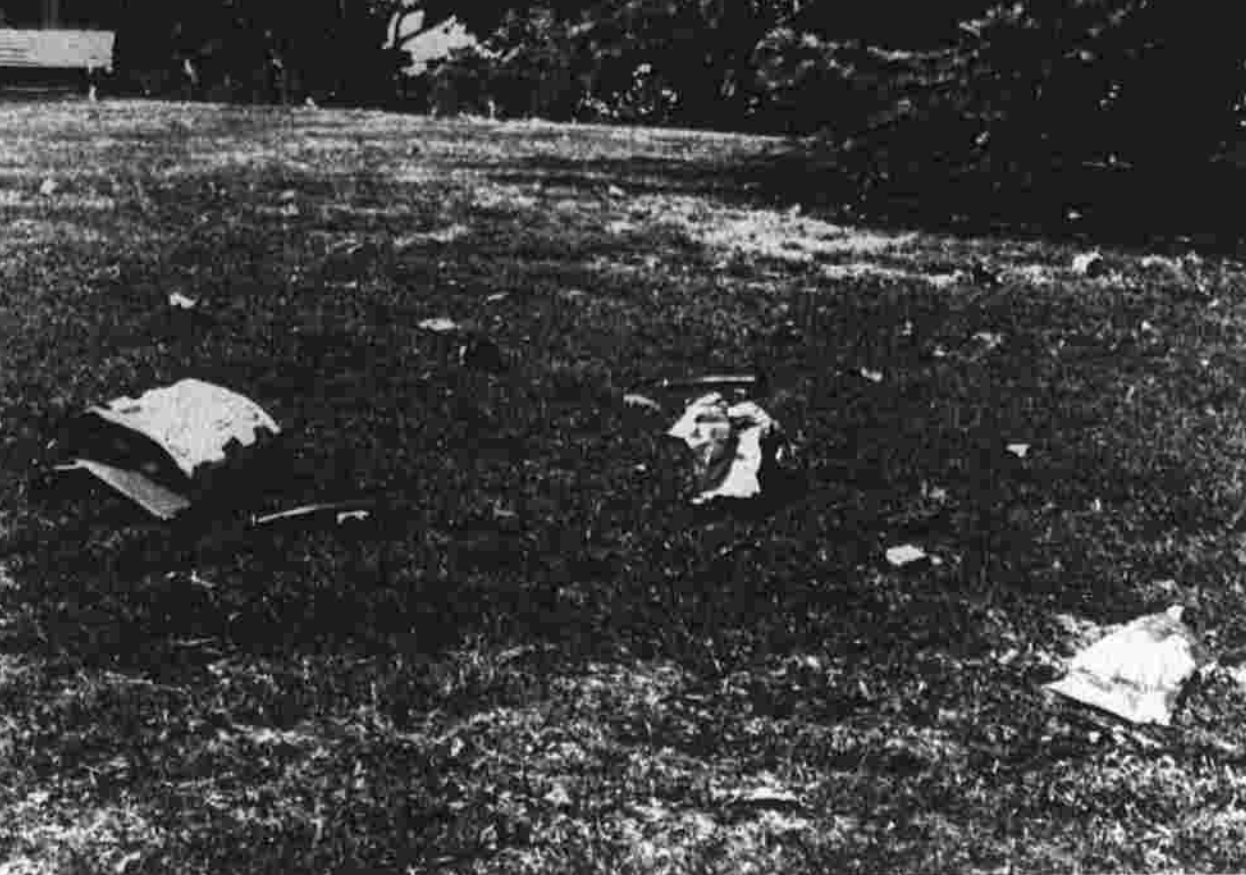
This is a recent view of Center Park from Main St.

KANSAS CITY (AP)—Almost half the Roman Catholic diocese priests in the United States disagree with Pope Paul's encyclical against artificial birth control, the National Catholic Reporter said today.